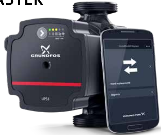
PRODUCT CODE 99199622

Occasionally UPS3 won't fit, but either way we think you will appreciate knowing for sure. www.grundfos.co.uk/go-replace